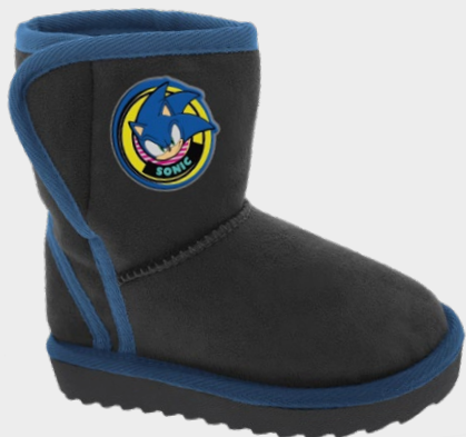
S1LSON25-08 SONIC THE HEDGEHOG™