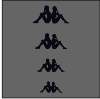
PRINT AT BACK