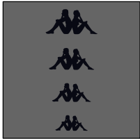
PRINT AT SIDE