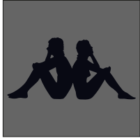
PRINT AT FRONT